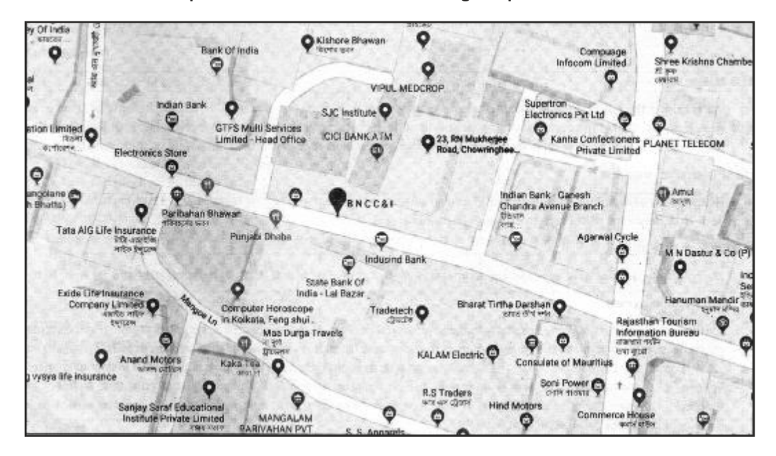
41A, AJC Bose Road 505, Diamond Prestige, Kolkata - 700 017